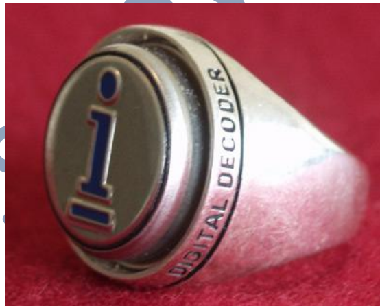
Figure 1: prototype of stainless steel java ring.