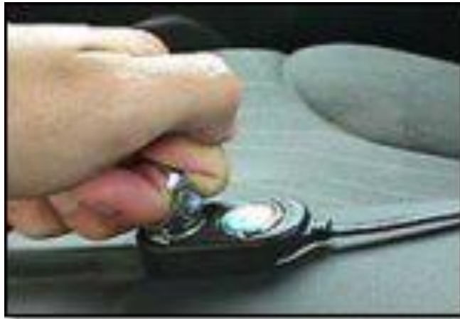
Figure 5.1: how java ring is used in security of car.

The Sun concept car's security is based on a Java ring that contains a profile of the user. You connect the Java ring to a ring receptor in the car, and the car knows, based on your profile, what you are allowed to do. For example, a ring given to a mechanic or valet allows that person to see the dashboard and drive 40 miles per hour within a one block radius, but no faster or farther. In a family where both the husband and wife drive the car, each has individualized settings, so that when they enter the car, their environments are configured to the profiles on their rings. Java rings are authorized through Personal Identification Numbers (PINs) so that no one can steal a person's ring and run off with the car.