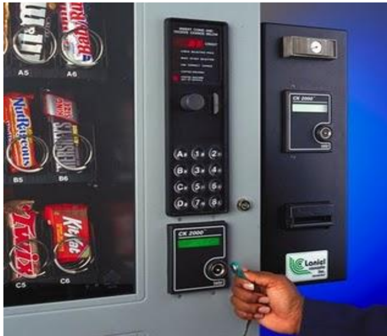
Figure: application of java ring in vending machines and ATMs.

automated rental cars. In this potential market, a driver can use his or her ring to access a vehicle and simply leave it when done. Billing, reservations, vehicle monitoring, vehicle location, and all other functions are done via wireless communication. The net result is a very inexpensive rental car for local use by residents and tourists. This will create a new business for rental car companies competing for business travelers in the saturated airport rental car market.