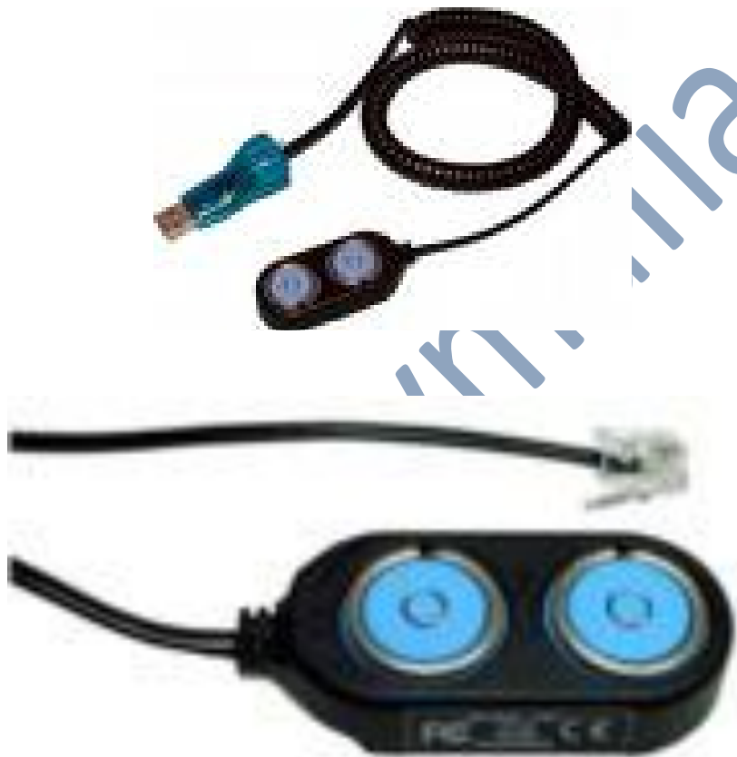
Figures3.6: different types of blue dot receptor in the market.

Each receptor contains two Blue Dots to accommodate instances where multiple iButtons are required for a transaction. A company's policy may, for example, require both an employee and a supervisor to authenticate access to sensitive information stored on a network server.