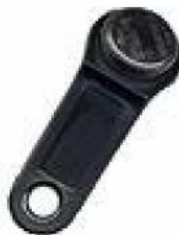
Figures 3.5.2: different types of iButtons available in the market