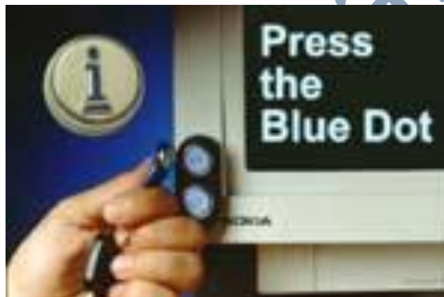
Figure: application of java ring for getting account balance of an user through internet

The java ring is used initially as rugged portable data carriers. often in harsh environmental condition. it is used for many real world application e.g for opening the door ,in the e-banking application for getting the balance in your account. Logging in your personal computer. Providing security in your car. iButton memory devices have been deployed in vast quantities as rugged portable data carriers, often in harsh environmental conditions. Among the large-scale uses are as transit fare carriers in Istanbul, Turkey; as maintenance record carriers on the sides of Ryder trucks; and as mailbox identifiers inside the mail compartments of the U.S. Postal Service's outdoor mailboxes. They are worn as earrings by cows in Canada to hold vaccination records, and they are used by agricultural workers in many areas as rugged substitutes for timecards.