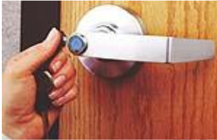
Figure 4: how java ring is used to open the door