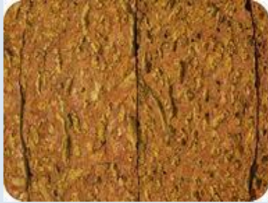
Figure 8. A laterite is the type of thick, nutrient poor soil that forms in the rainforest.

In tropical rainforests where it rains literally every day, laterite soils form (figure 8). In these hot, wet, tropical regions, intense chemical weathering strips the soils of their nutrients. There is practically no humus. All soluble minerals are removed from the soil and all plant nutrients are carried away. All that is left behind are the least soluble materials, like aluminum and iron oxides. These soils are often red in color from the iron oxides. Laterite soils bake as hard as a brick if they are exposed to the sun.