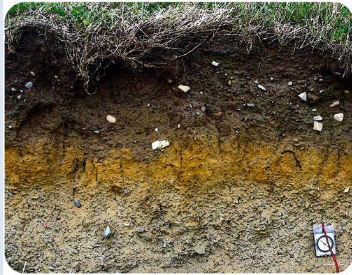
Figure 3. Soil is an important resource. Each soil horizon is distinctly visible in this photograph.

A residual soil forms over many years, as mechanical and chemical weathering slowly change solid rock into soil. The development of a residual soil may go something like this.