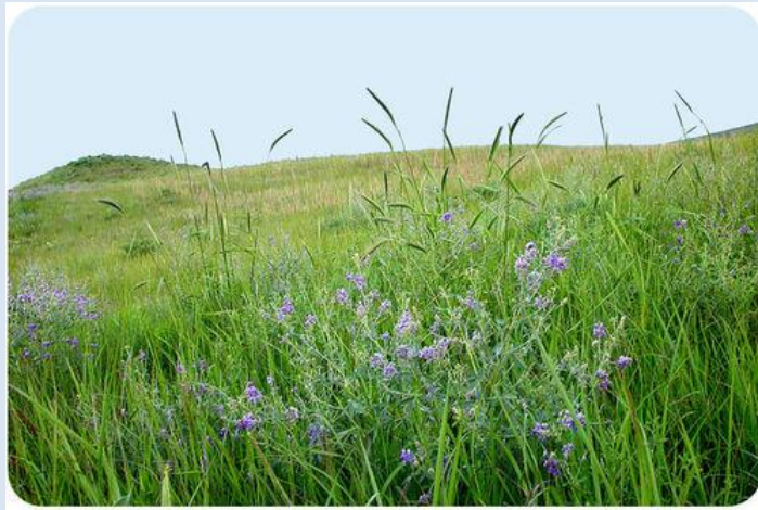
Figure 7. A pedocal is the alkaline type of soil that forms in grassland regions.

Pedocal soils form in drier, temperate areas where grasslands and brush are the usual types of vegetation (figure 7). The climates that form pedocals have less than 65 cm rainfall per year, so compared to pedalfers, there is less chemical weathering and less water to dissolve away soluble minerals so more soluble minerals are present and fewer clay minerals are produced. It is a drier region with less vegetation, so the soils have lower amounts of organic material and are less fertile.