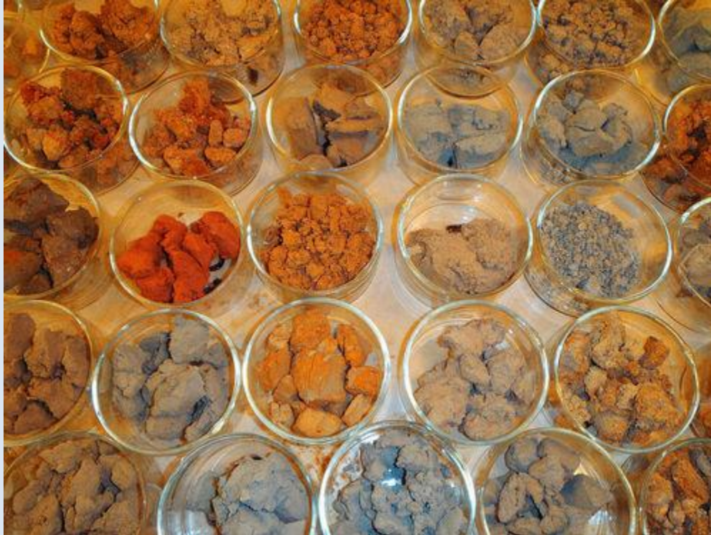
Figure 5. Just some of the thousands of soil types.