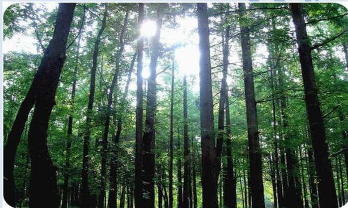
Figure 6. A pedalfer is the dark, fertile type of soil that will form in a forested region.

Deciduous trees, the trees that lose their leaves each winter, need at least 65 cm of rain per year. These forests produce soils called pedalfers , which are common in many areas of the temperate, eastern part of the United States (figure 6).